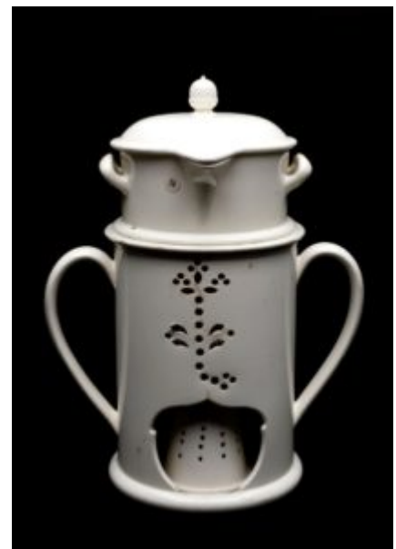
Food warmer, England, 1801-1850. Science Museum, London.

2) There is a lot of research that can be done with the content currently digitised, however, many archives only have less than 5-10% of their holdings digitally available. Getting this content online, and in a searchable format is a high priority. In this regard, additional funding could be used to run scanathons and transcribathons, to allow more digital content to be unlocked for researchers. This could also encompass citizen science projects to transcribe archives and recipes. Another next step is creating standardised tagging and meta data systems for recipes to allow searching across collections.