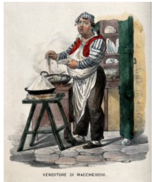
A cook is standing in a kitchen with food in pans on the tables in front of him. Coloured lithograph.

AHRC US-UK Food Digital Scholarship network is inclusive of all food-related digital materials across the interdisciplinary food system, to include a wide variety of digitised corpuses and artefacts ranging from digitised cookbooks and food texts, collections in archives (medicinal texts, food manuals, menus, social media